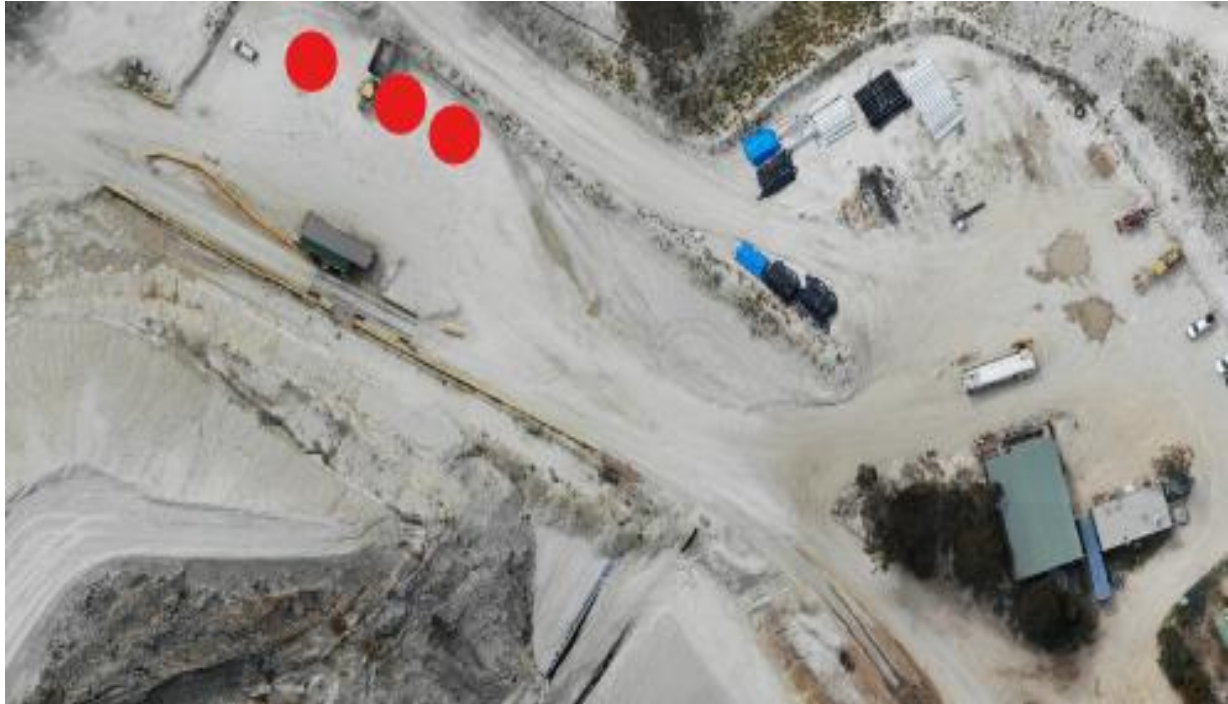
Windellama's Truck Waiting Areas

Waiting points for breaks and Bus Curfews for each site will be outside the weighbridge marked with RED dots at all HiQ site locations.